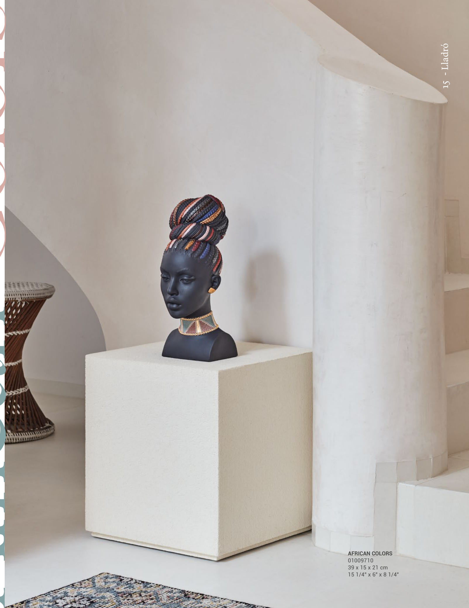
AFRICAN COLORS 01009710 39 x 15 x 21 cm 15 1/4" x 6" x 8 1/4"