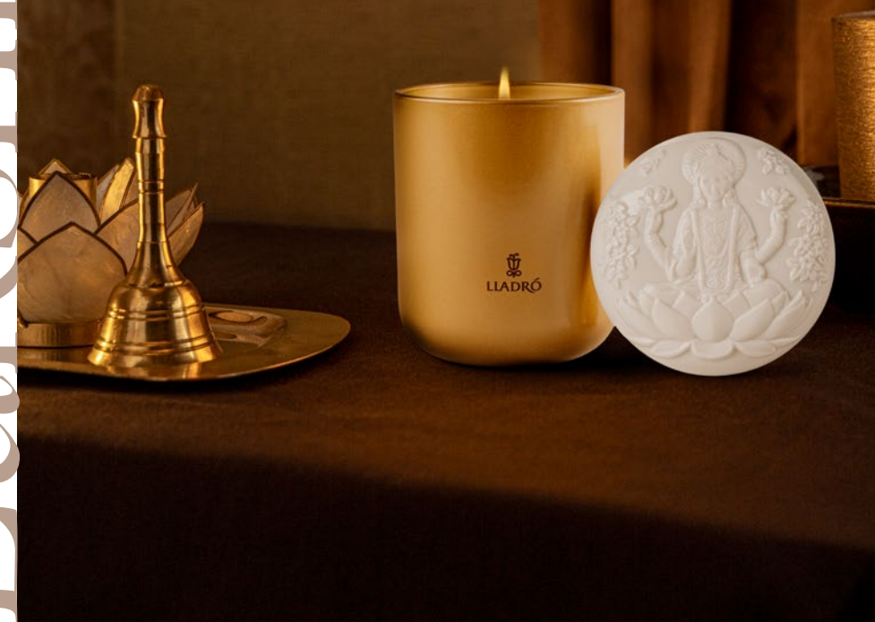
GODDESS LAKSHMI CANDLE - SWEET MEMORIES 01040307 12 x Ø8 cm 4 3/4" x Ø3 1/4"

The porcelain lid of this candle is decorated with a minutely engraved etching of Lakshmi, one of the best-loved deities in Hindu homes. The goddess of good future and prosperity also represents the path to fulfillment in life.