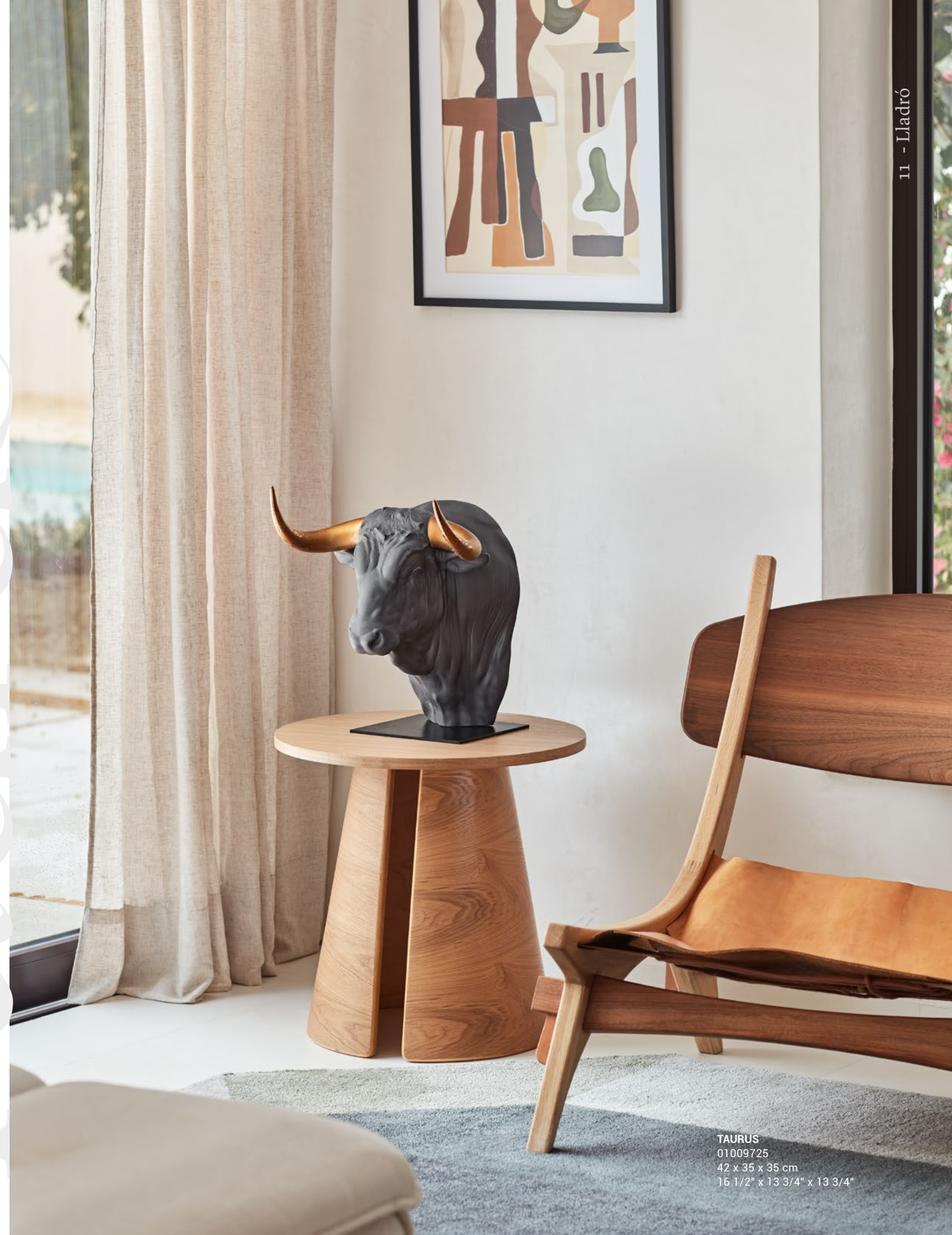
TAURUS 01009725 42 x 35 x 35 cm 16 1/2" x 13 3/4" x 13 3/4"