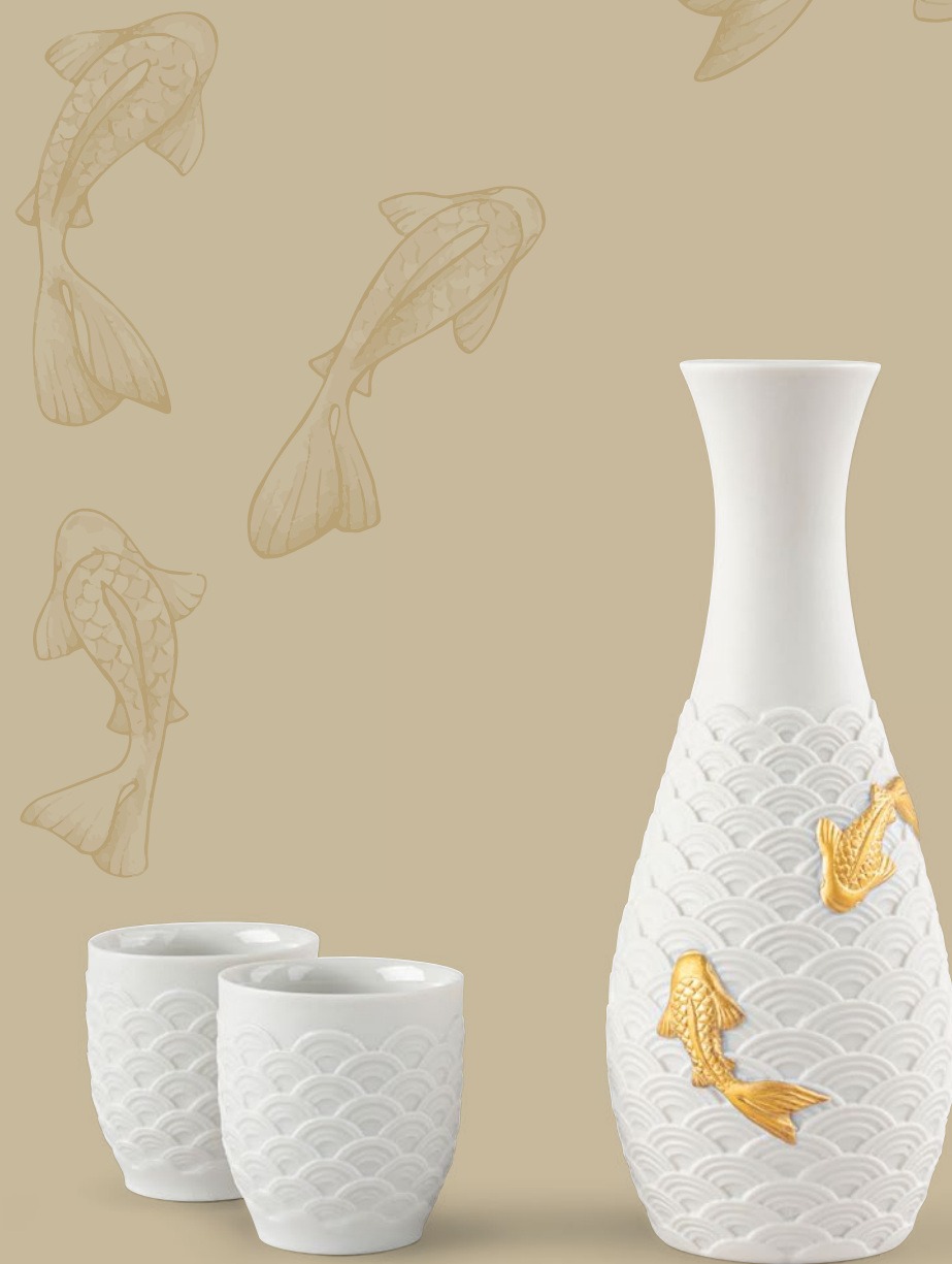
KOI SAKE SET 01017824 18 x 17 x 7 cm 7 x 6 3/4" x 2 3/4"

The three pieces are made in white porcelain with a matte finish on the outside and glazed on the inside and an elegant geometrical decoration inspired by the scales of the koi. The bottle also depicts two koi with a golden luster finish.