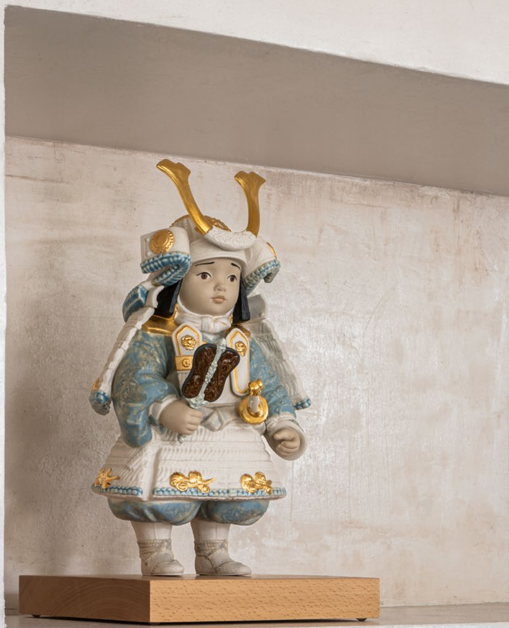
JAPAN PREMIERE WARRIOR BOY (WHITE) 01013054 36 x 21 x 19 cm 14 1/4" x 8 1/4" x 7 1/2" Limited Edition of 500 units

Warrior Boy is inspired by one of the best-loved traditions in Japanese culture. Boy's Day is celebrated on the fifth day of the fifth month. For the occasion dolls dressed in samurai armor are displayed at home to wish for a long and healthy life for young boys, and to symbolize the virtues of courage and determination.