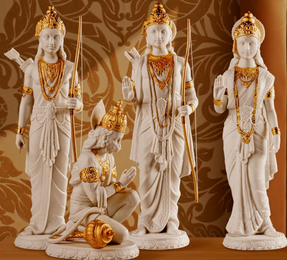
LAKSHMAN (RE-DECO) 01009717 30 x 10 x 8 cm 11 3/4" x 4" x 3 1/4"

The four characters in the story are depicted in this composition. Each one is made in matte white porcelain, decorated solely with golden luster. This combination underscores the masterfully etching, ornamentation and details our artists have recreated.