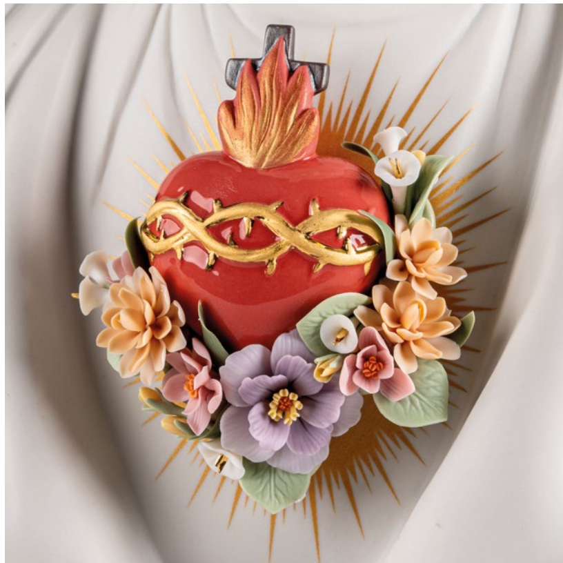
SACRED HEART OF JESUS 01009711 40 x 26 x 20 cm 15 3/4" x 10 1/4" x 7 3/4"