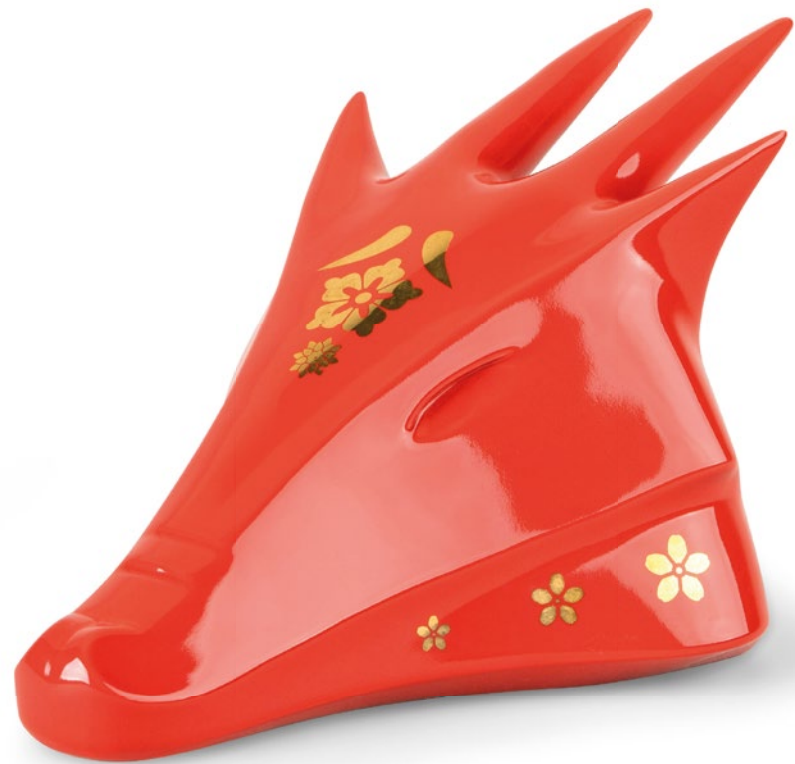
DRAGON (RED - GOLD) 01009713 13 x 16 x 24 cm 5" x 6" x 9 1/2"

Our artists have portrayed this zodiac sign, which also commences the Lunar New Year, in a sculptural creation that mixes contemporary design with traditional colors like red and gold.