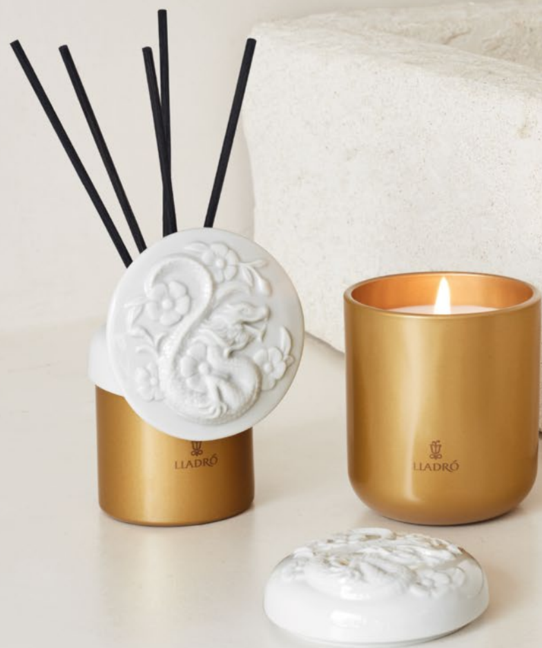
DRAGON PERFUME DIFFUSER - REDWOOD FIRE 01040300 21 x 9 x 9 cm 8 1/4" x 3 1/2" x 3 1/2"

Besides, the Chinese Zodiac collection of home fragrances is also expanded with the Dragon candle and diffuser.