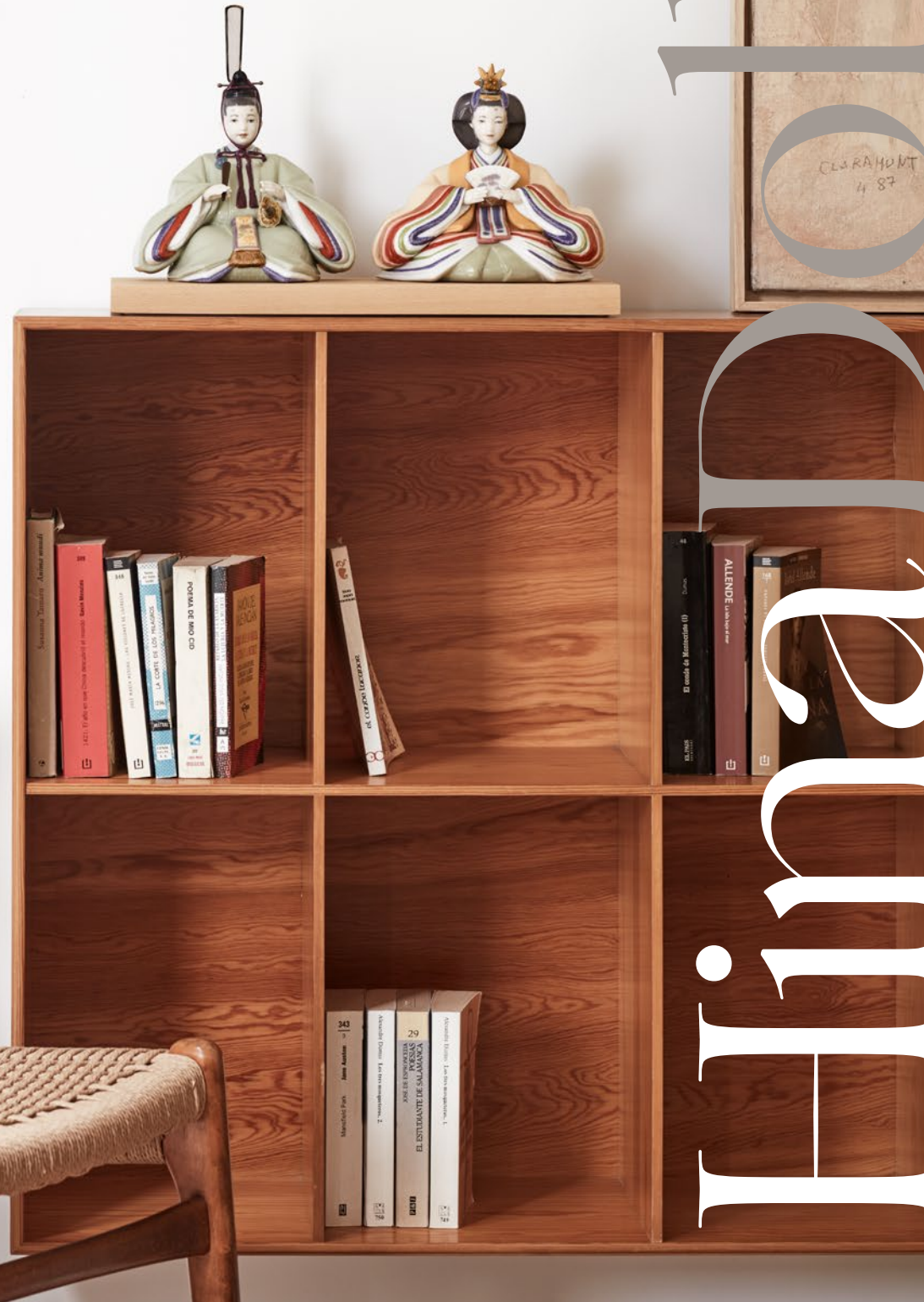
JAPAN PREMIERE HINA DOLLS (GREEN-YELLOW) 01009723 25 x 41 x 22 cm 9 3/4" x 16 1/4" x 8 3/4" Limited Edition of 500 units

They were emperors during the Heian period, a time of peace and tranquility. A time of samurais, of poetry and art, in which the emperor and empress upheld traditions and behaved with courage, wisdom and kindness. With the passing of the years the figure of the emperors became a symbol of fortune and fulfilment, and for that reason during the popular Hina Matsuri festival held every year in March, newborn baby girls receive a gift of Hina Dolls, an emperor and an empress, to wish them a happy and prosperous life.