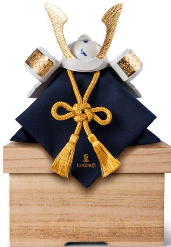
JAPAN PREMIERE SAMURAI HELMET – BLUE KOI 01013053 25 x 21 x 17 cm 9 3/4" x 8 1/4" x 6 3/4" Limited Edition of 500 units

This porcelain creation is inspired by the helmets of ancient samurais, one of the most characteristic elements of the armor of these famous warriors. Its faithfulness and respect for traditional models is a homage to Japanese culture.