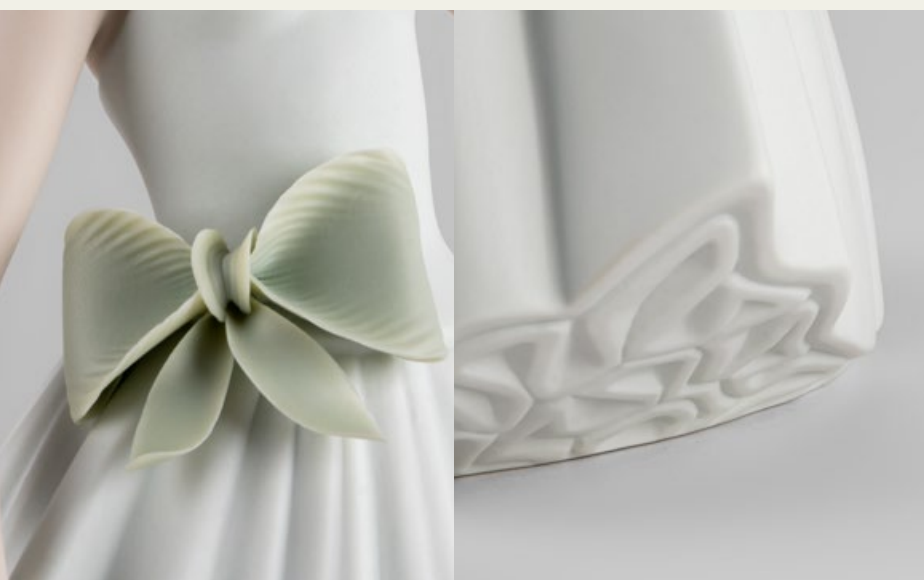
ANNUAL PIECE 2022 MY FAVOURITE GOWN 01009567 34 x 26 x 15 cm 13 ½ x 10 ¼ x 6"