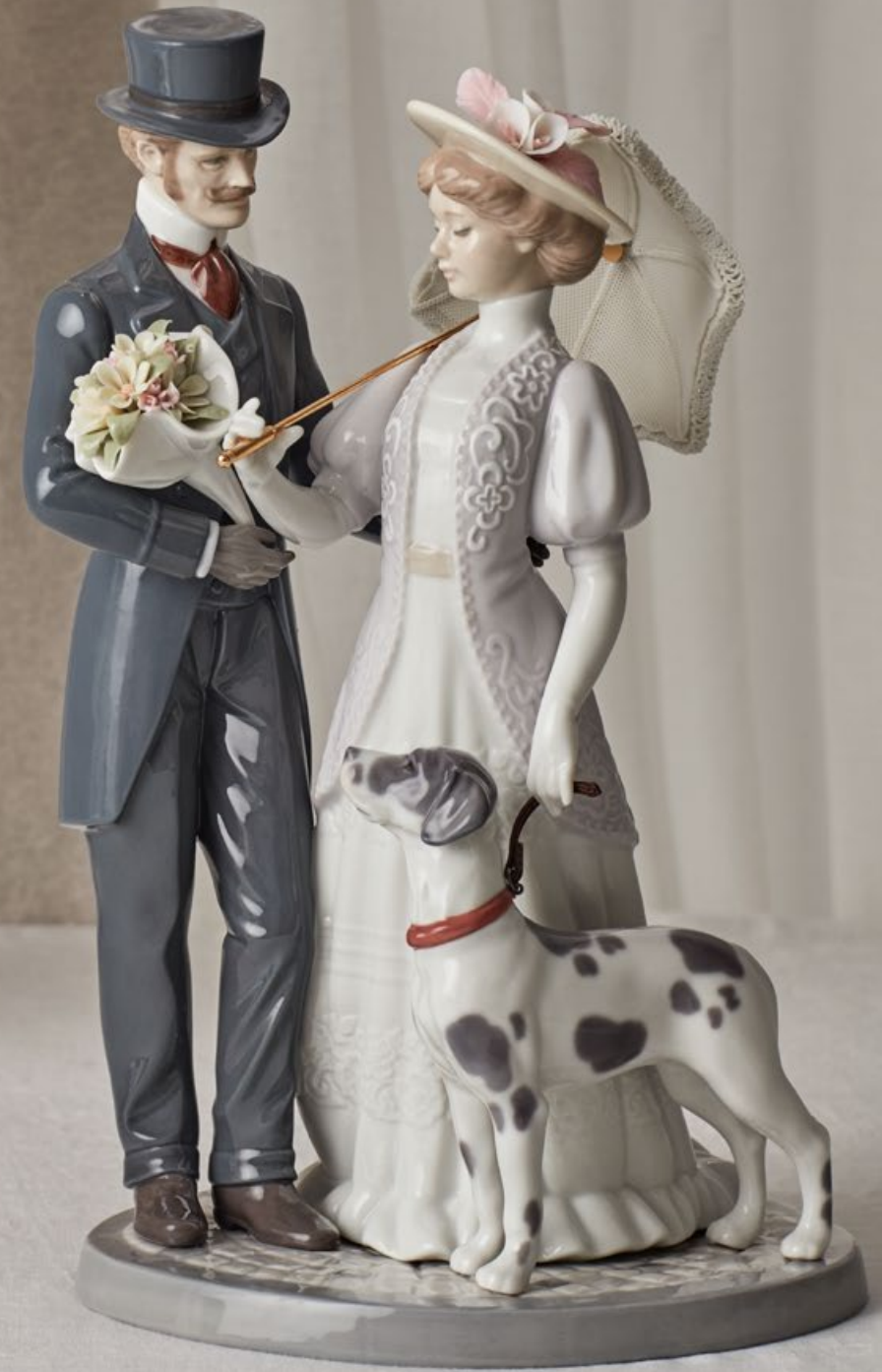
A ROMANTIC STROLL 1009551 33 x 22 x 18 cm 13 x 8 ¾ x 7"