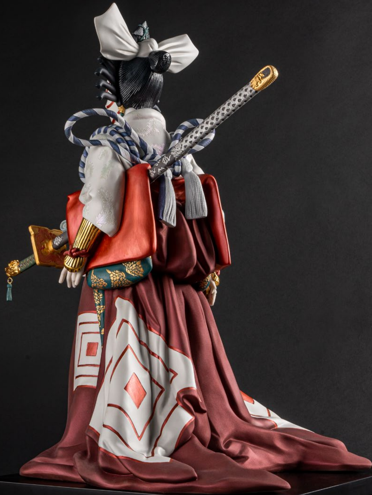
High Porcelain JAPAN-KABUKI 01002028 71 x 47 x 60 cm 28 x 18 ½ x 23 ½" Limited Edition of 250 pieces Base included