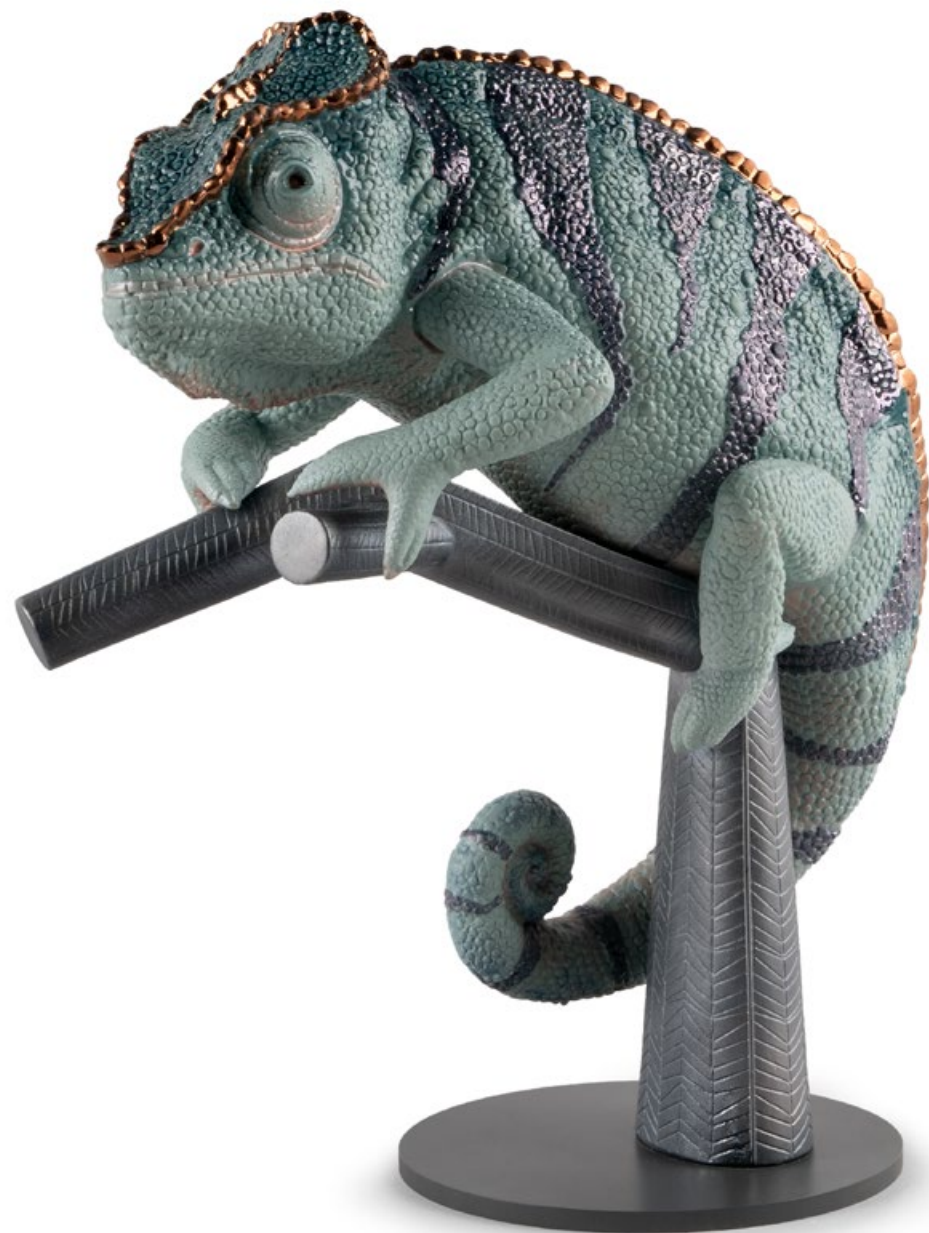
CHAMELEON 01009564 30 x 24 x 13 cm 11 ¾ x 9 ½ x 5"

The blue, copper and pearlescent lusters with iridescent touches applied on this chameleon make it an excellent example of the mastery of Lladro's ornamentation artists. The brand's team of experts etch each and every detail by hand, including the animal's scaly skin and the branch on which it is resting.