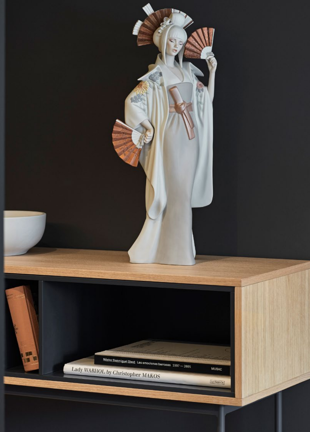
JAPANESE DANCER 01009555 57 x 23 x 18 cm 22 ½ x 9 x 7"