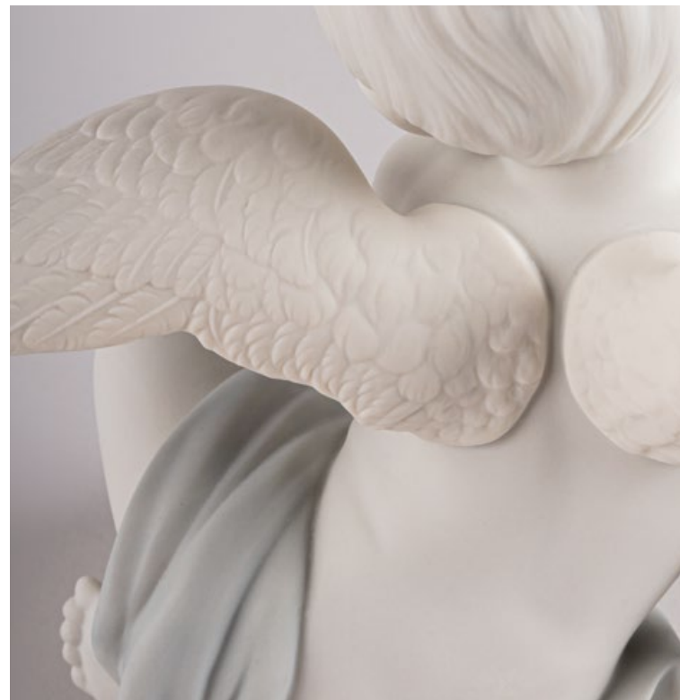
ANGELICAL MOMENTS 01009568 20 x 26 x 18 cm 7 ¾ x 10 ¼ x 7"

Angels, the stars of many creations coming from the Lladró workshops, now have a new depiction. A cherub, with perfectly executed facial features and exquisitely etched wings, looks in wonder at a cute little butterfly that has landed on his arm. Made in matte white porcelain with subtle notes of color, the scene produces tender emotions.