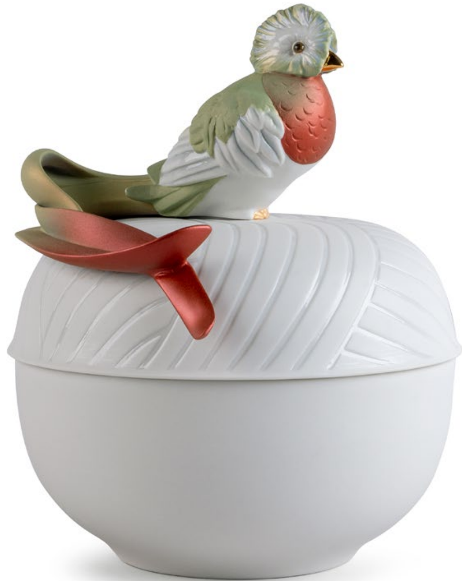
QUETZAL BOX 01009650 26 x 21 x 20 cm 10 ¼ x 8 ¼ x 7 ¾"

Functional objects featuring beautiful creatures from tropical jungles. Quetzal Box and Hummingbird Box contrast the wealth of coloring of the birds with the matte holders, with varnished details that underscore the lines of the etching on the lids. The birds are decorated with lusters and with metallic, iridescent pigments in a wide spectrum of colors.