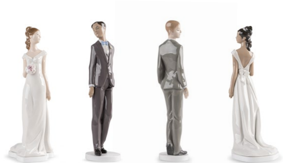
SOULMATES - BRIDE I 01009573 29 x 10 x 13 cm 11 ½ x 4 x 5"