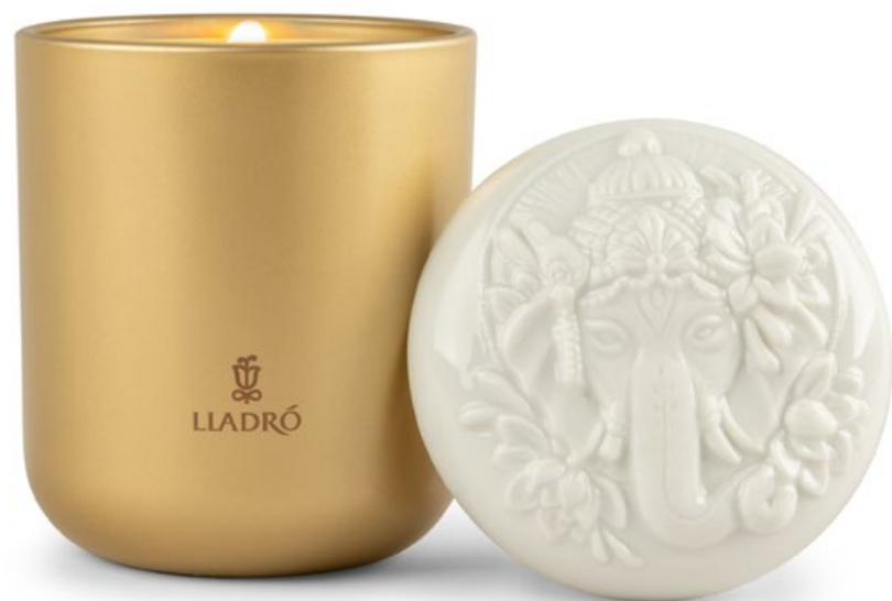
LORD GANESHA CANDLE - GARDENS OF VALENCIA 01040304 12 x 8 x 8 cm 4 ¾ x 3 ¼ x 3 ¼" 200 g - 7.05 oz

Gardens of Valencia is a delicate perfume with citric fruity notes of bergamot, tuberose, sandalwood and musk.