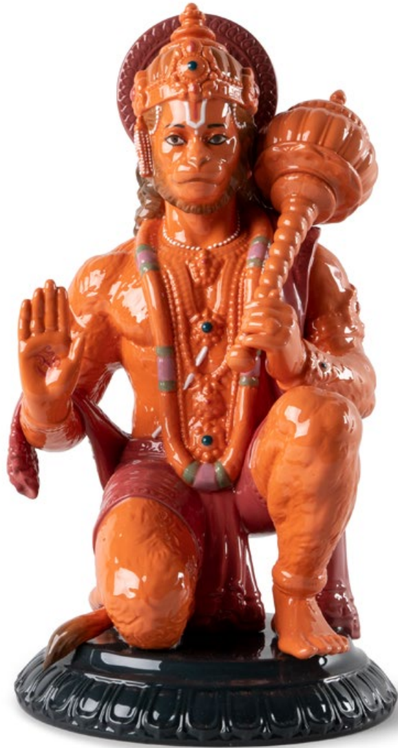
HANUMAN-ORANGE 01009557 27 x 15 x 15 cm 10 ¾ x 6 x 6"

This special edition of Hanuman: Lord of the Monkeys, venerated for his courage, learning and loyalty, plays with the energy of the coloring to make it even more striking. The range of oranges and reds is combined with profuse ornamentation focused above all on the coat, garlands, pendants, headdress and face. The coloring is further enhanced by notes of white, brown, green and black that underscore the symbolism of this venerated god.