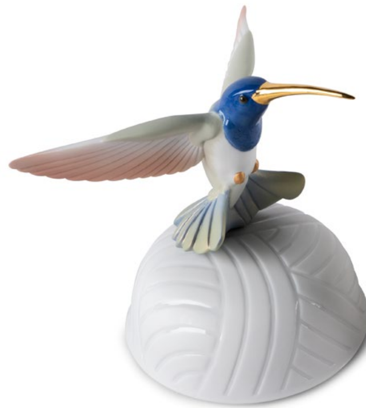
HUMMINGBIRD BOX 01009651 29 x 18 x 16 cm 11 ½ x 7 x 6 ¼"

The refined treatment of the boxes and the exquisite detail of the birds are matched and combined in a perfect play of contrasts.