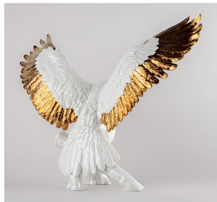
FREEDOM EAGLE (WHITE-COPPER) 01009578 48 x 57 x 28 cm 19 x 22 ½ x 11"

The infinite variety of wildlife is behind Wild Soul , a collection of white creations decorated with metallic lusters, to which this spectacular eagle is now added. The king of the sky is a symbol of power and freedom which Lladró artists have depicted with their renowned consummate control of sculpture and ornamentation. This eagle is made in glazed white porcelain with copper-colored luster decoration.