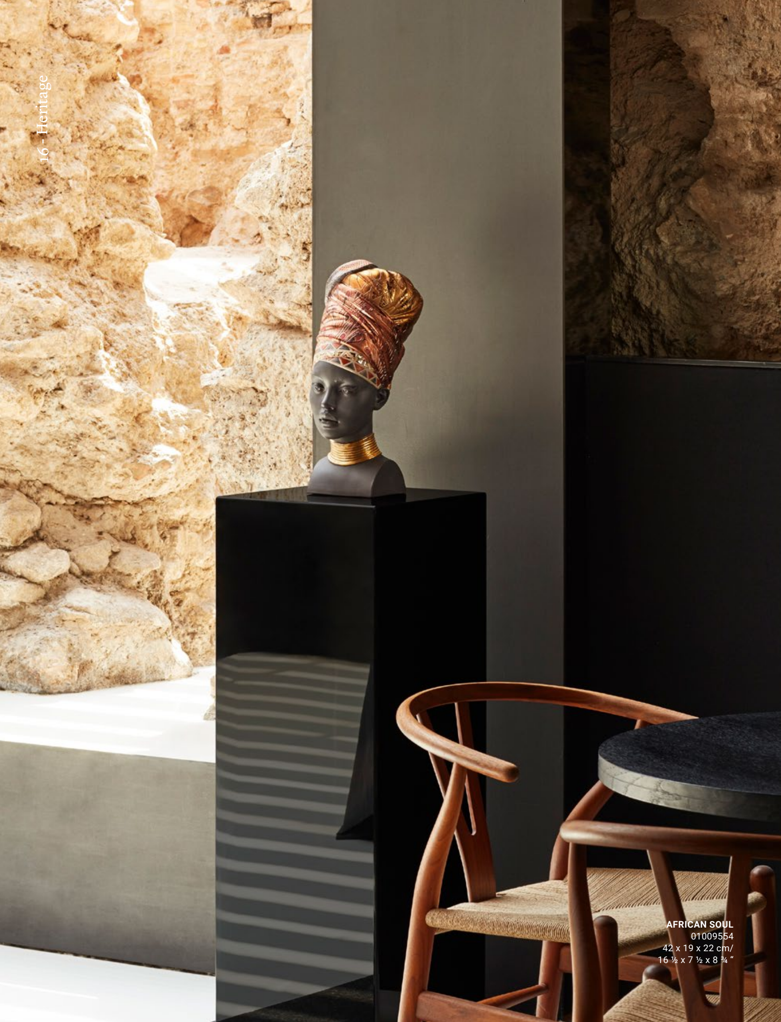
AFRICAN SOUL 01009554 42 x 19 x 22 cm/ 16 ½ x 7 ½ x 8 ¾"