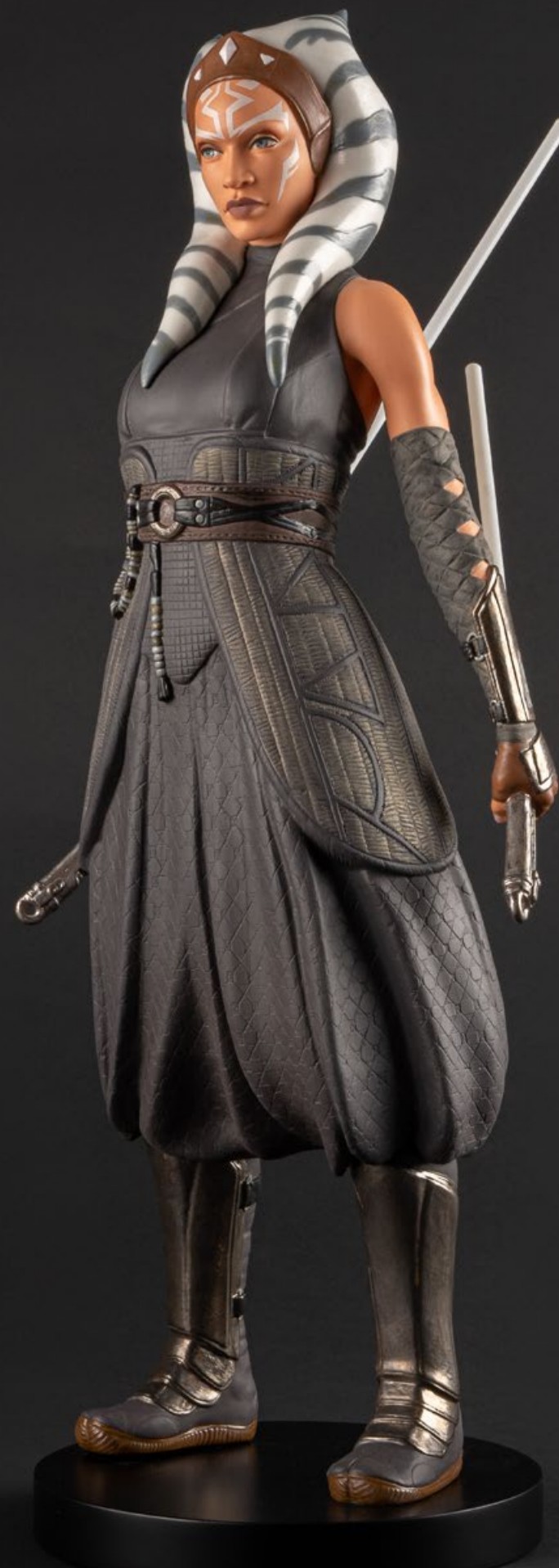
AHSOKA TANO 01009420 56 x 24 x 29 cm 22 x 9 ½ x 6 ½"