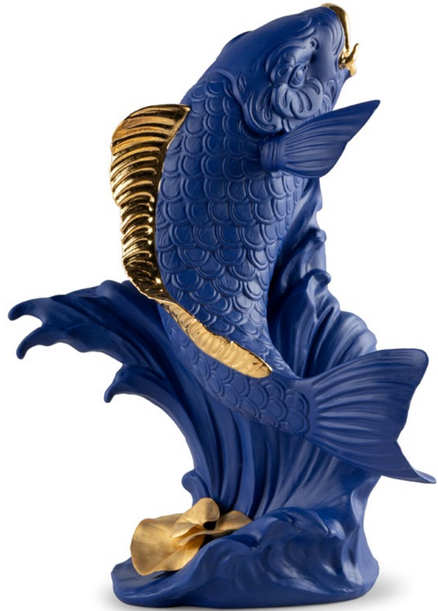
KOI (BLUE-GOLD) 01009579 31 x 21 x 24 cm 12 ¼ x 8 ¼ x 9 ½" Limited Edition of 750 pieces

Koi carp symbolize fortune, patience and long life.